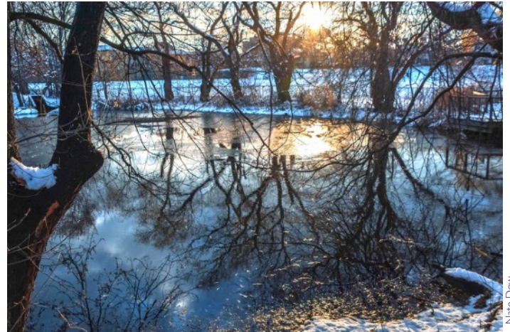
A golden winter sun. December, 2017

Setting up a bird feeder may pique these benign effects, a small token to expiate our transgressions. Hang a wooden platform from your kitchen or bay window, or for a wider view, install a column feeder (perhaps with squirrel shield) in your yard. Your steady gifts of sunflower seeds, nuts, millet, suet, cut citrus and apples, will not go unnoticed by chickadees, nuthatches, blue