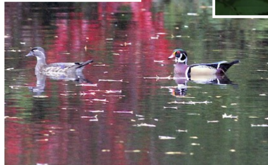
A small sampling of Bruce's photos at Hall's Pond over the years.